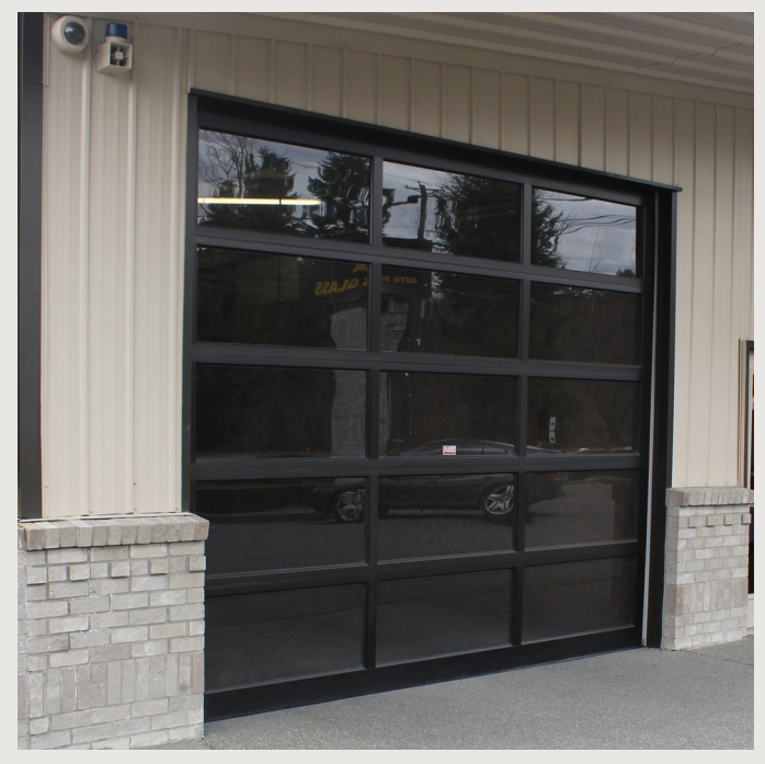
- Dark Bronze Anodized Finish with Greylite Glass Panels - 5 Section / 3 Panel