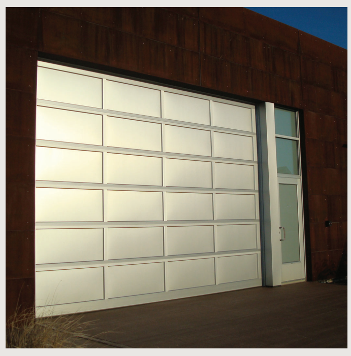
- Clear Anodized Finish with .050 Smooth Aluminum Panels -6 Section / 4 Panel